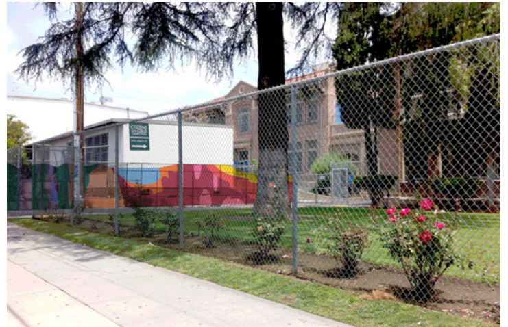
The mural is an abstract representation of the Santa Monica Mountains just beyond the schools.

"However, with the whole completed fence design as a backdrop for our end-of-year school ceremony, we were struck as a community by how powerful the design looked altogether and how many little hands went into producing something far greater," she said.